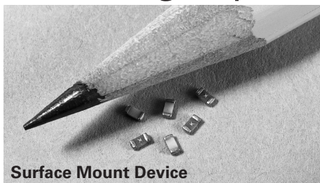
Surface Mount Device