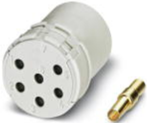
Contact insert, Number of positions: 16, Type of contact: Socket, Crimp connection

Please be informed that the data shown in this PDF Document is generated from our Online Catalog. Please find the complete data in the user's documentation. Our General Terms of Use for Downloads are valid ( http://phoenixcontact.com/download )