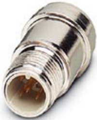
Sensor/actuator flush-type plug, 4-pos., M12, A-coded, front/press-in mounting, with straight solder connection

Please be informed that the data shown in this PDF Document is generated from our Online Catalog. Please find the complete data in the user's documentation. Our General Terms of Use for Downloads are valid ( http://download.phoenixcontact.com )