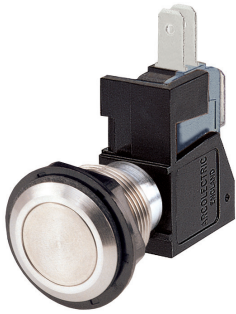
C0911VA - - -