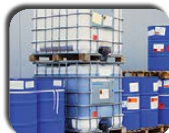
Diesel Exhaust Fluid