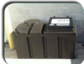
Cooking Oil Recycling