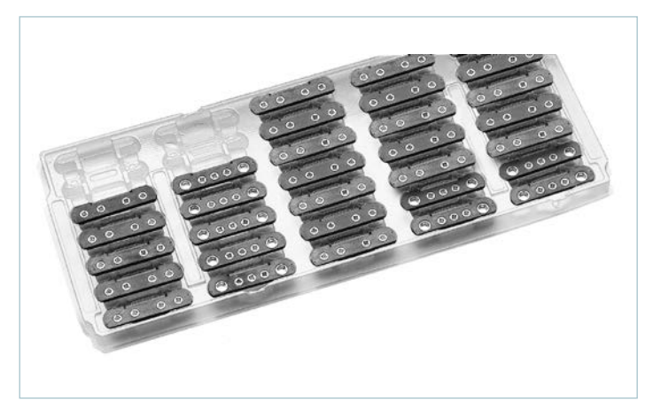
Figure 15.2 — SurfMates; individual part numbers