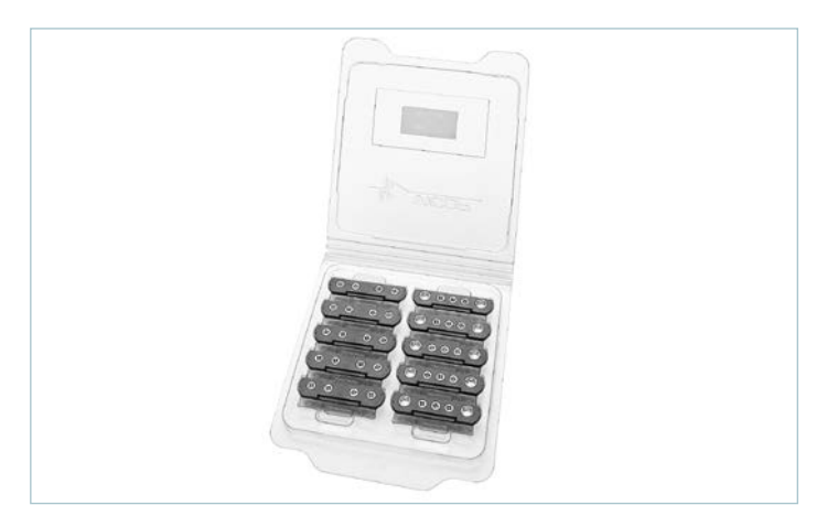
Figure 15.1 — SurfMates; five-pair sets