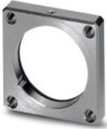
Square mounting flange, 4xM3

Please be informed that the data shown in this PDF Document is generated from our Online Catalog. Please find the complete data in the user's documentation. Our General Terms of Use for Downloads are valid ( http://download.phoenixcontact.com )