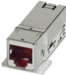
RJ45 female insert, for Freenet-System, CAT6<sub>A</sub>, 8-pos., shielded, with cable connection

Please be informed that the data shown in this PDF Document is generated from our Online Catalog. Please find the complete data in the user's documentation. Our General Terms of Use for Downloads are valid ( http://download.phoenixcontact.com )